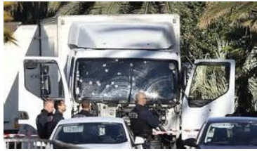
El Camion que mato 84 personas

Padre Nuestro - El Evangelio de hoy nos lleva a reflexionar sobre la oración del Padrenuestro, la oración perfecta porque fue el mismo Cristo quien la enseñó a sus discípulos y a toda su Iglesia, que la reza en todo el mundo en forma incesante. En las siete peticiones del Padrenuestro están contenidos todos los bienes. Los únicos y los verdaderos bienes que debemos pedir, y en el orden en que debemos hacerlo. Las tres primeras peticiones tienen por objeto la gloria de Dios: la santificación de su nombre, la venida del reino y el cumplimiento de la voluntad divina. Las otras cuatro peticiones presentan al Padre nuestros deseos: están referidas a nuestra vida, nuestro alimento y nuestra curación del pecado. Cuando decimos: Santificado sea tu nombre, estamos pidiendo la gloria de Dios por sí mismo. Es la mayor alabanza que podemos hacer al Creador, porque lo reconocemos como santo. Este es el primer bien que domina y contiene a todos los demás bienes. Con esta primera petición, el Señor nos enseña que debemos desear más la gloria de Dios, que cualquiera de nuestros intereses. En la segunda petición pedimos que venga a nosotros tu Reino.